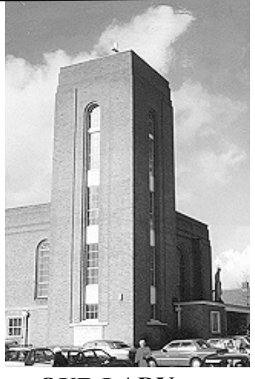
OUR LADY, QUEEN OF APOSTLES